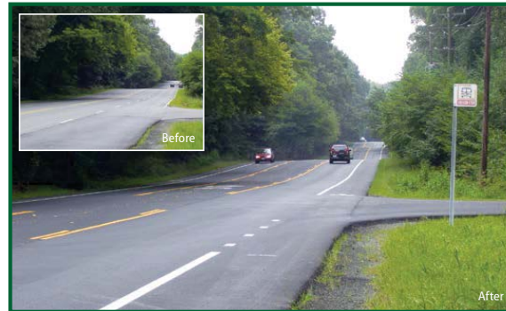
Lawyers Road, before and after a 2009 Road Diet

Reston, Virginia, a suburb of Washington, DC, is a planned community with a larger emphasis on non-motorized travel than many suburbs. The need for multi-modal accessibility has increased with the opening of a nearby rail transit station.